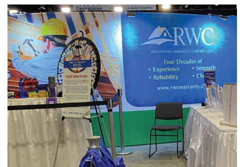
HOME/RWC's booth featuring the Wheel 'O Warranties