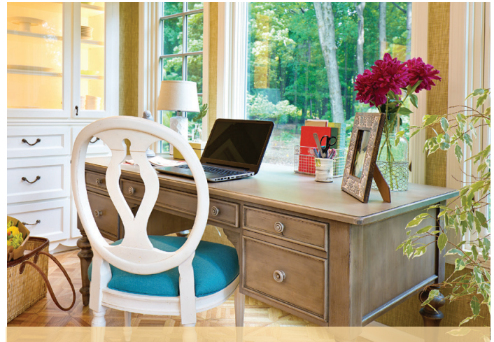
Gone are the days where a home office was an afterthought.

Gyms have been some of the slowest businesses to re-open. Getting into a workout routine after stress-eating for months is now a common concern. Re-imagining floor plans to include more rooms, or more space in general, is important for home comfort moving forward